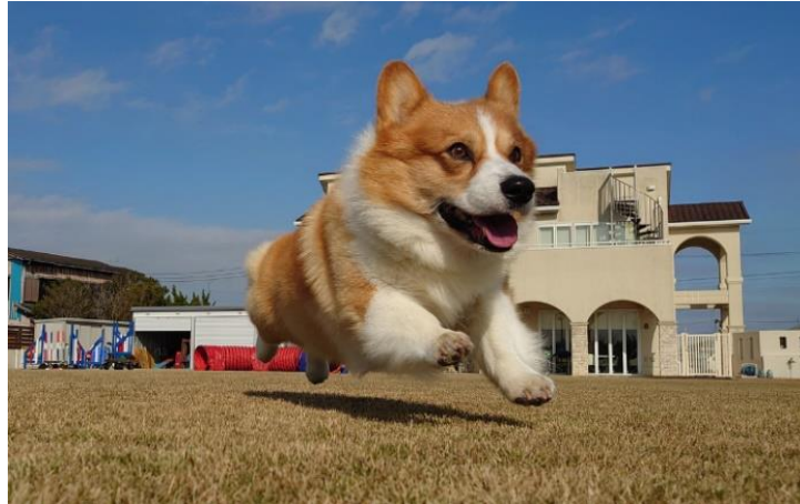
Taken with Xperia 1 II

Xperia 1 II fast focus also works in low light conditions delivering quality images in challenging circumstances thanks to the four technologies working together, including Dual photo diode sensor vi , an auto-focus system that covers approximately 70 percent of the sensor vii , 3D iToF sensor viii and a new large 1/1.7” Exmor RS TM for mobile sensor, making it 1.5x more sensitive than the previous model and resulting in a faster and an accurate AF in low light shooting.